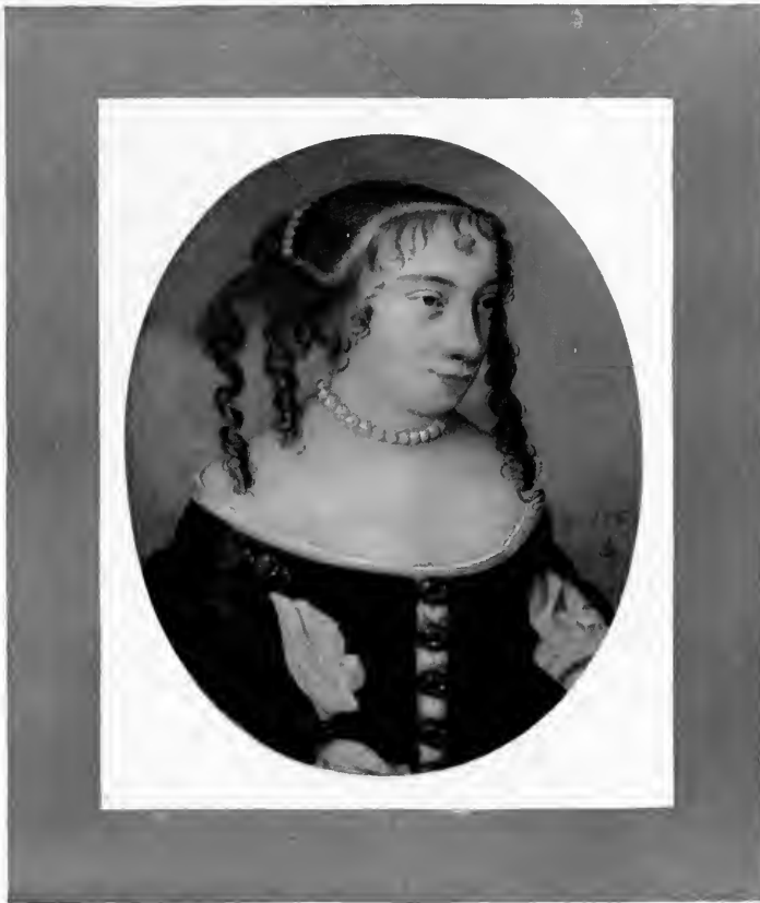
VISCOUNTESS FAUCONBERG, DAUGHTER OF OLIVER CROMWELL BY SAMUEL COOPER